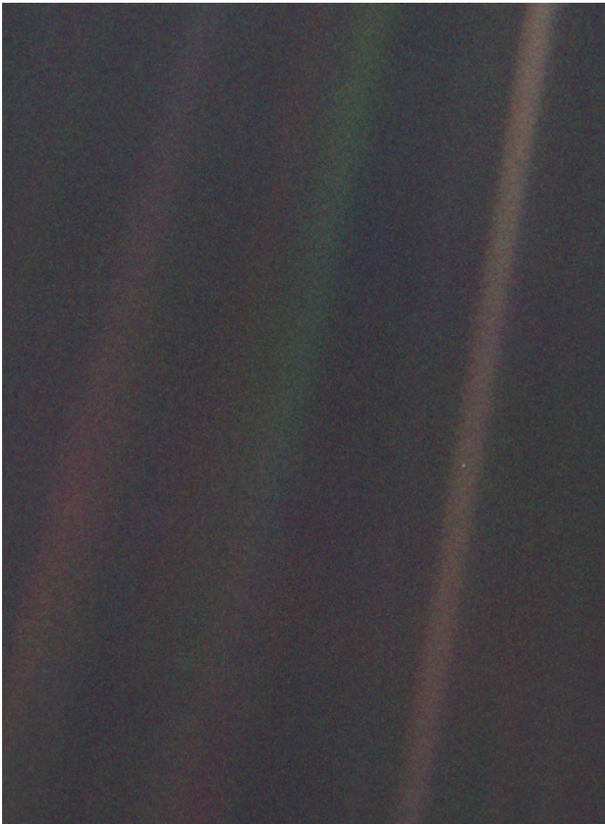
Foto der Erde, das von der Raumsonde Voyager 1 aus ca. 6,4 Milliarden Kilometern Entfernung